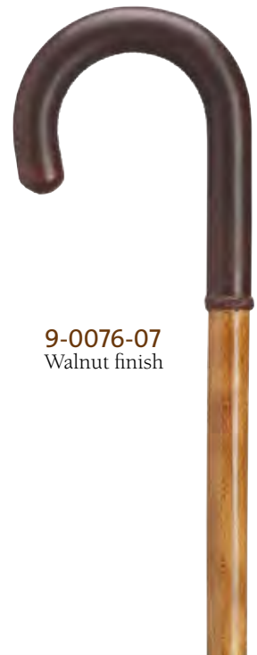
9-0076-07 Walnut finish

MEN'S GENUINE LEATHER COVERED DERBY HANDLE Hardwood cane with brass ring on stained shaft.