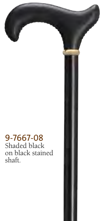
9-7667-08 Shaded black on black stained shaft.