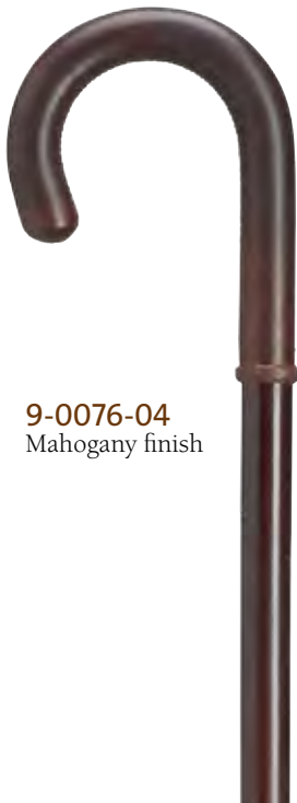
9-0076-04 Mahogany finish