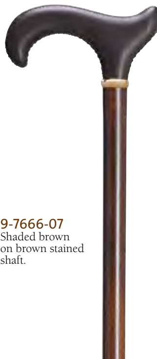
9-7666-07 Shaded brown on brown stained shaft.