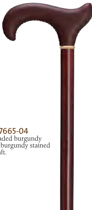
9-7665-04 Shaded burgundy on burgundy stained shaft.

MEN'S GENUINE LEATHER COVERED DERBY HANDLE Hardwood cane with brass ring on stained shaft.