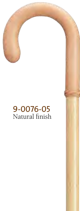
9-0076-05 Natural finish