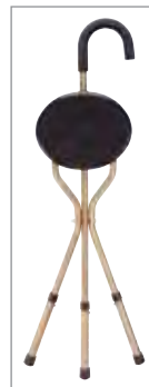
9-0225-00 Adjustable, aluminum three leg seat cane, bronze with black oval seat and supports up to 200 lbs.