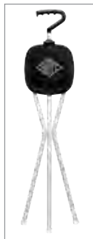
9-0224-00 Aluminum seat cane silver with three leg and square black seat. Seat height is 21" and supports up to 250 lbs.