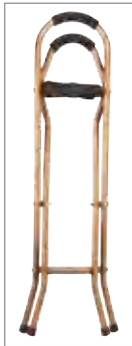
9-0228-00 Steel four leg black seat cane with 12" round padded seat. Seat height is 17-1/2" and supports up to 250 lbs.