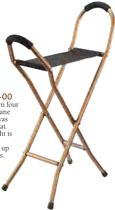
9-0227-00 Aluminum four leg seat cane with canvas saddle seat. Seat height is 21" and supports up to 250 lbs.

Folds for Easy Transportation and Storage • Supports from 200 to 250 lbs.