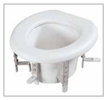
MDS80315 Universal Locking

Steel legs go to the floor and soft foam armrests provide maximum support in getting on and off the toilet.