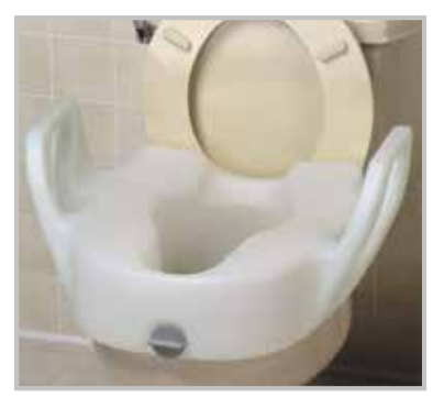
MDS80320S Locking with Molded Arms

Padded arm rests assist in getting on and off toilet. Locking device secures seat to toilet and requires no tools.