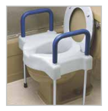
MDS80326 Extra Wide with Legs 600 lb (272 kg) Capacity

Steel legs go to the floor and soft foam armrests provide maximum support in getting on and off the toilet.