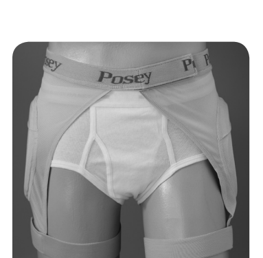
6019 / 6019H

REF 6017H Hipsters, Incontinent Brief with High Durability Removable Pads