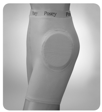
6016 / 6016H

Standard Unisex Brief easily fits over undergarments, or can be worn as underwear.