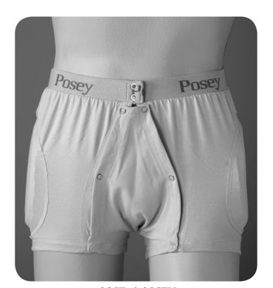
6017 / 6017H

Incontinent Brief features a snap front for easier application over adult diapers.