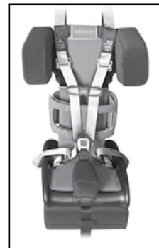
SPECIAL NEEDS STAR