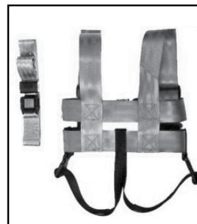
EZ-ON MODIFIED VEST, FRONT AND BACK