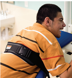
The support strap provides additional security during hygiene care.