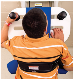
Handholds and slots in the trunk board enable the user to assist in a transfer.