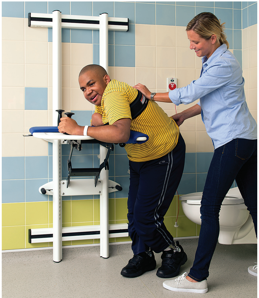
The elbow curves enable a user with limited hand function to assist in a transfer and maintain position on the trunk board.

Beyond toileting: The Support Station can ease the sit-to-stand transition in any setting. Clients can self-assist the stand-pivot transfer from wheelchair to adaptive chair or support themselves in an upright position for clothing changes prior to a swim session.