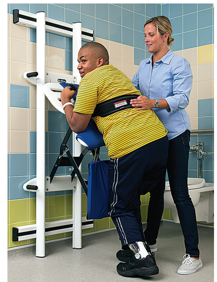
With the kneeboard in use, adjust the trunk board angle to a more upright position to promote increased weight-bearing.