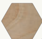
10. CHERRY (R/W/T Series)

5 wood stains and three backrest styles enable you to customize the Wood Thera-Glide® to your liking.