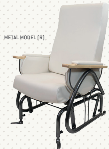
METAL MODEL (R)