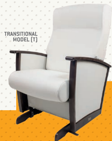
TRANSITIONAL MODEL (T)