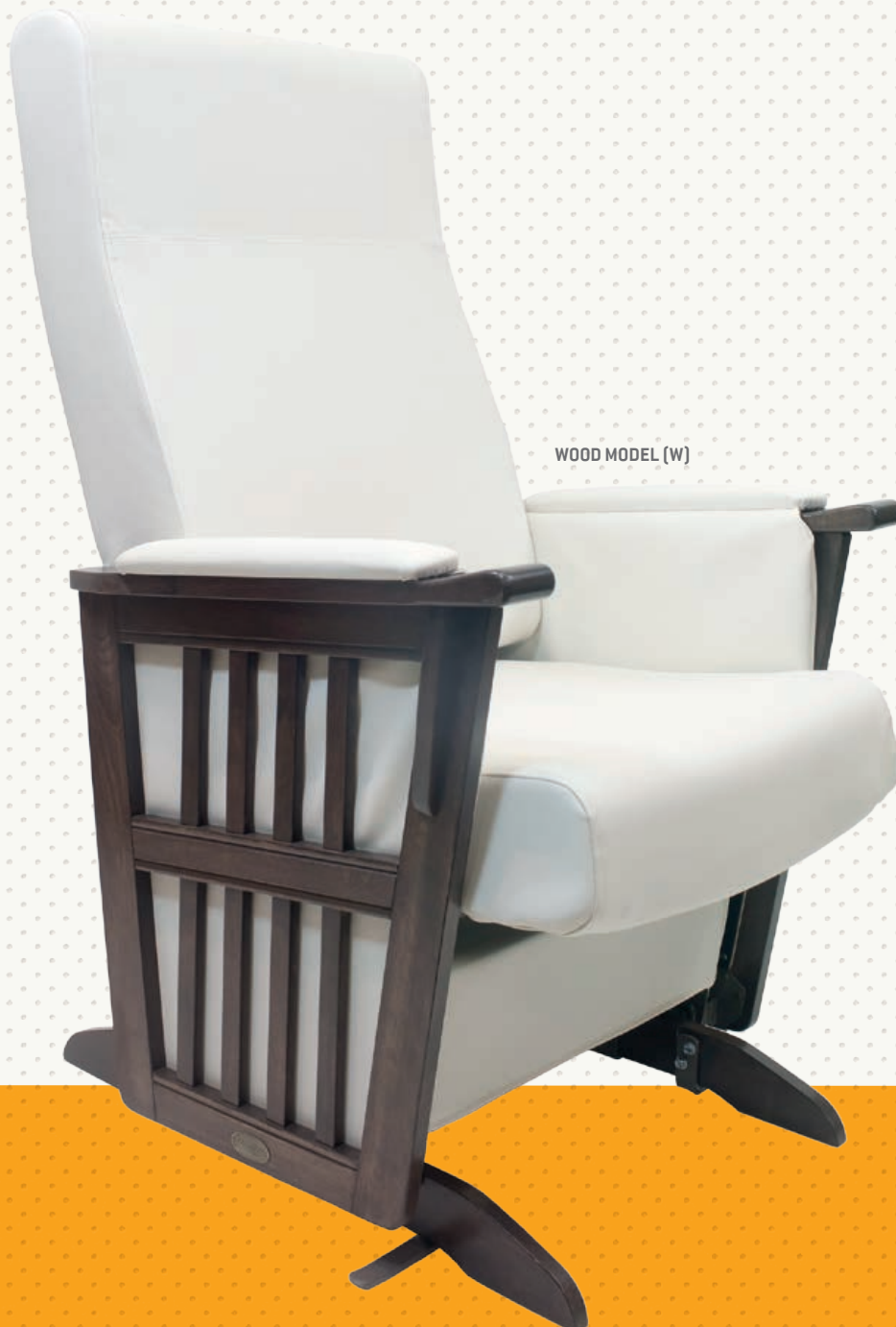
WOOD MODEL (W)