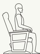
Secure when sitting down

The Thera-Glide® glider has a place for itself in the healthcare world, both for its therapeutic effects and for its incredible functional and safety features. Its patented automatic immobilization mechanism keeps the chair fixed when getting up and allows rocking when the person is fully seated. The system is easy, quiet and locks in any position. Depending on the model, its adjustment options and accessories, you can adapt the Thera-Glide® to meet your specific needs. It is easy to maintain thanks to the removable upholstery and the materials used in its design.