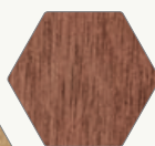
12. MAHOGANY (W/T Series)