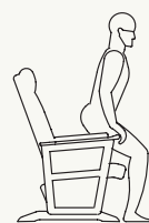
Secure when getting up