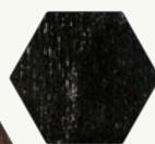
14. EBONY (W/T Series)