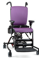
Large hi/lo base R870 Rifton Activity Chair