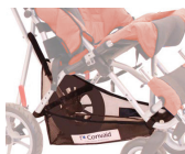
Under Seat Storage Basket