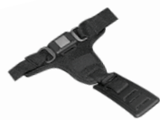
3-Pt Positioning Belt with Depth Adjustable Crotch Strap (Transit Required)