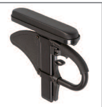
Low Profile, Single Post Armrest