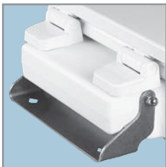
PROVIDES 4" OF ADDITIONAL HEIGHT WHEN SEAT IS INSTALLED