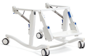
Mobile (tilt-in-space with footboard)