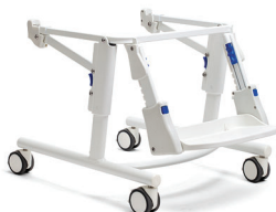
Mobile (non-tilt with footboard)