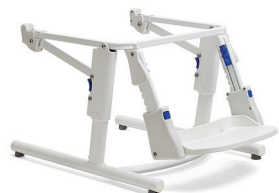
Stationary (non-tilt with footboard)

Note: Check clearance if using over a toilet.