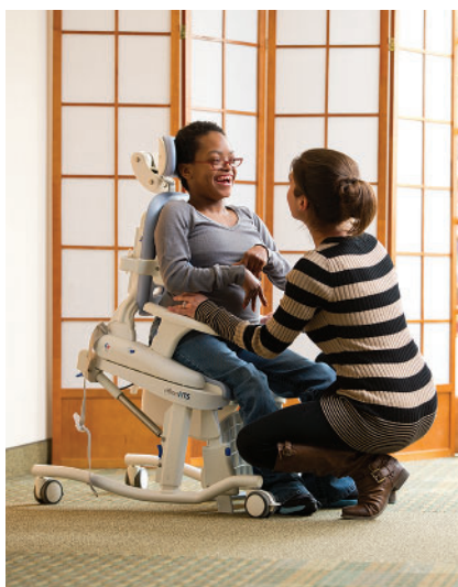
The forward tilt and the easily removed armrests make sit-to-stand and lateral transfers simple.