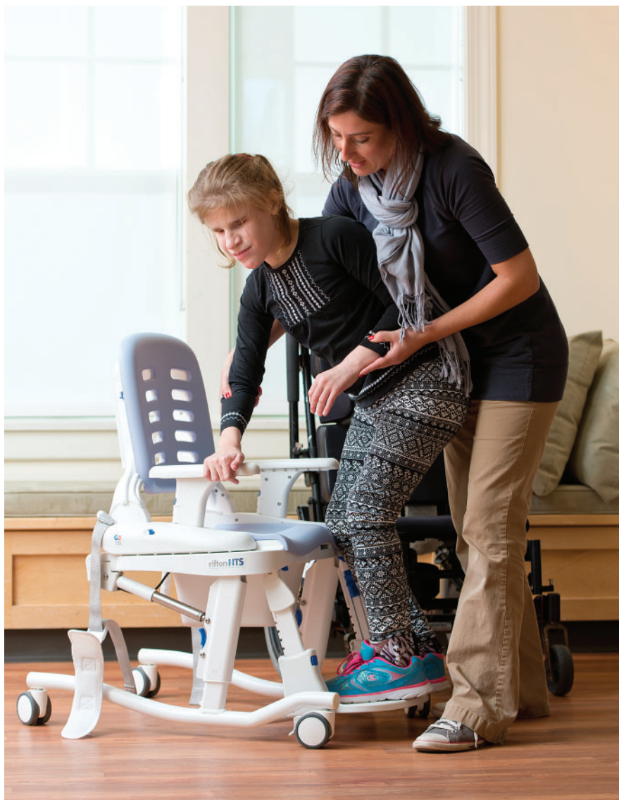
This client's whole weight is supported by the footboard as she assists in a transfer.

Lifts and transfers present a major challenge to successful toileting. The HTS makes them easier with features like a gas-assisted spring tilt adjustment for sit-to-stand transfers, removable armrests for lateral transfers and a weight-bearing footboard (up to 150 lbs) for front-loading transfers.