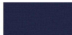
SILVERTEX SAPPHIRE BLUE