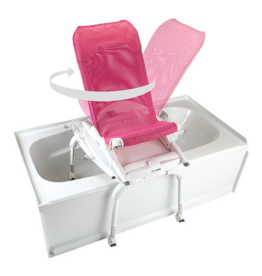
As the upper portion with the bath chair is rotated 90^{\circ} it moves approximately 12" back over the tub in one motion.