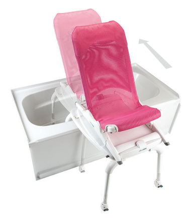
The tub transfer base starts in the position farthest out of the tub. It is then rolled back over the tub, and the brakes are set.