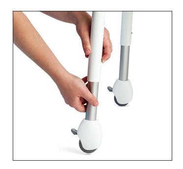
The legs of the tub transfer base can be adjusted to fit bathtubs up to 24" high.