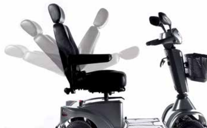
→ Quick backrest angle adjustment