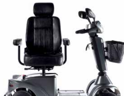
→ Seat rotation enables comfortable transfers