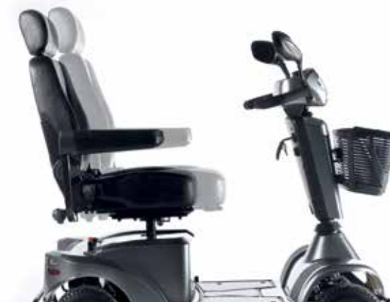
→ Infinite seat depth adjustment

The S700 advanced seating solution takes comfort to the highest level. From the seat height, seat depth and back recline adjustments, to the flip-up armrests including width, angle and depth adjustments – every feature has been designed for comfort – for you.