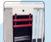
Crib Security Handle

Dual-action release handle is childproof and easy to operate, even with a child in one arm.