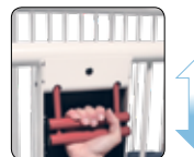
Lift Rail Upward or Downward