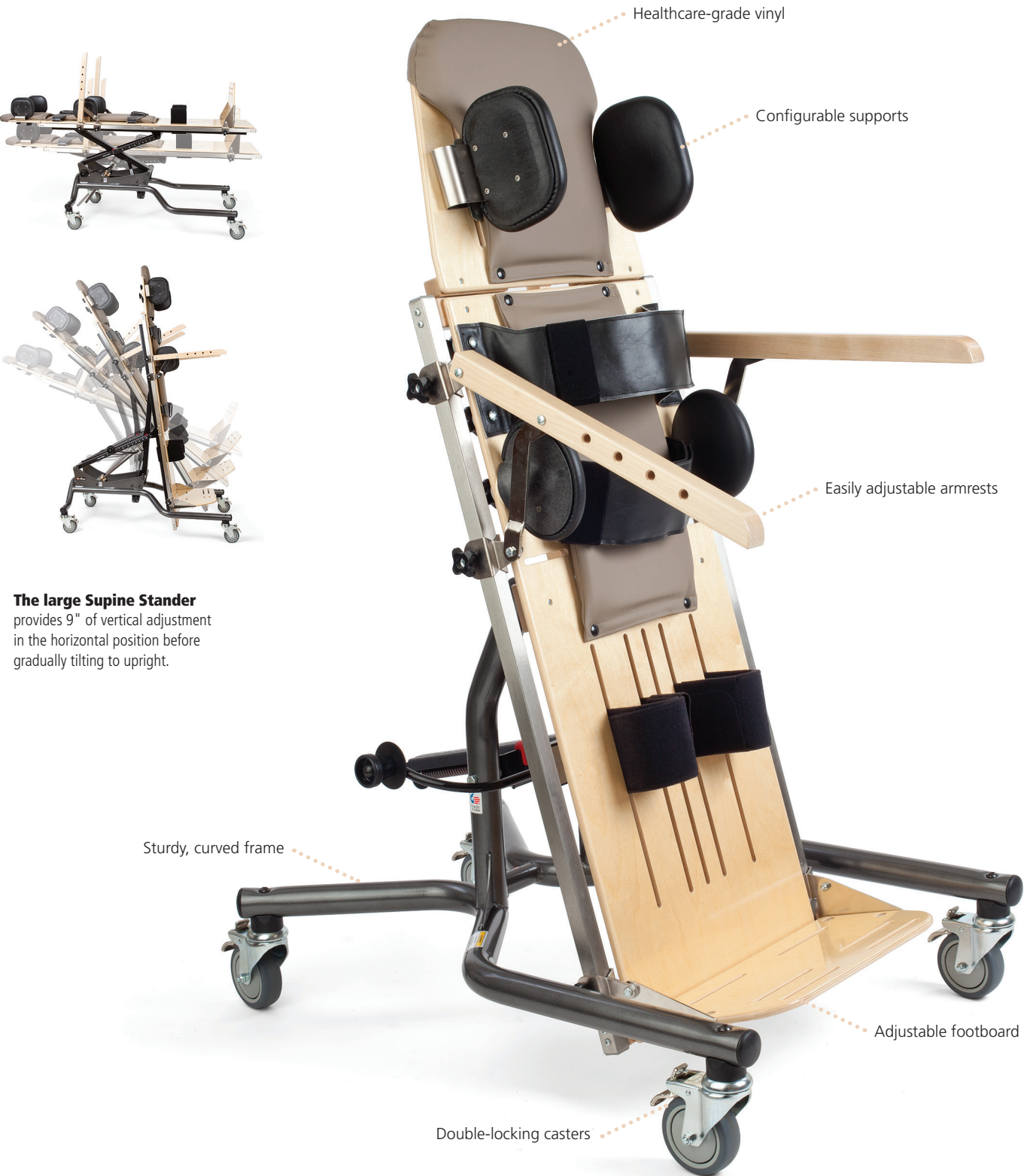
The large Supine Stander provides 9" of vertical adjustment in the horizontal position before gradually tilting to upright.