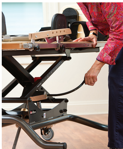
Use the frame's marked calibrations to record and maintain each client's optimal position.