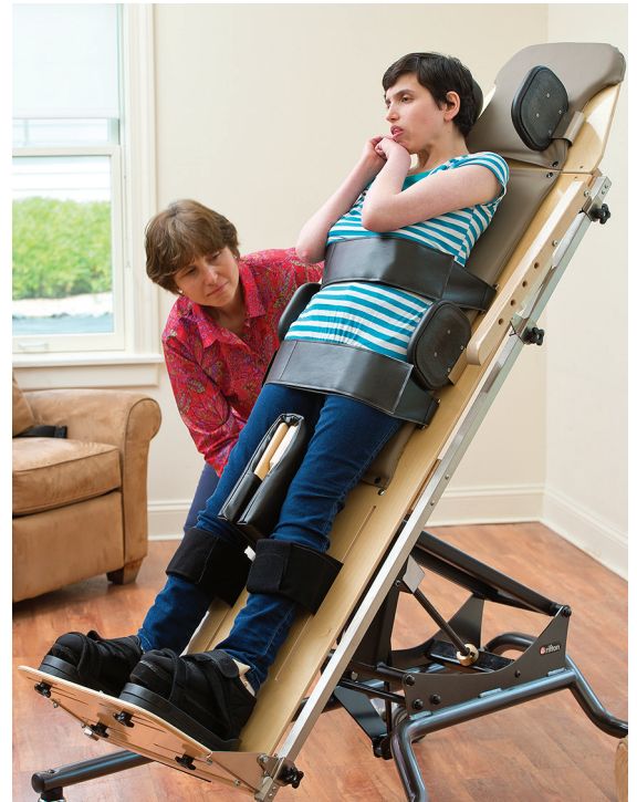
The Supine Stander stays secure at any angle. Turn the crank to gradually increase weight-bearing.