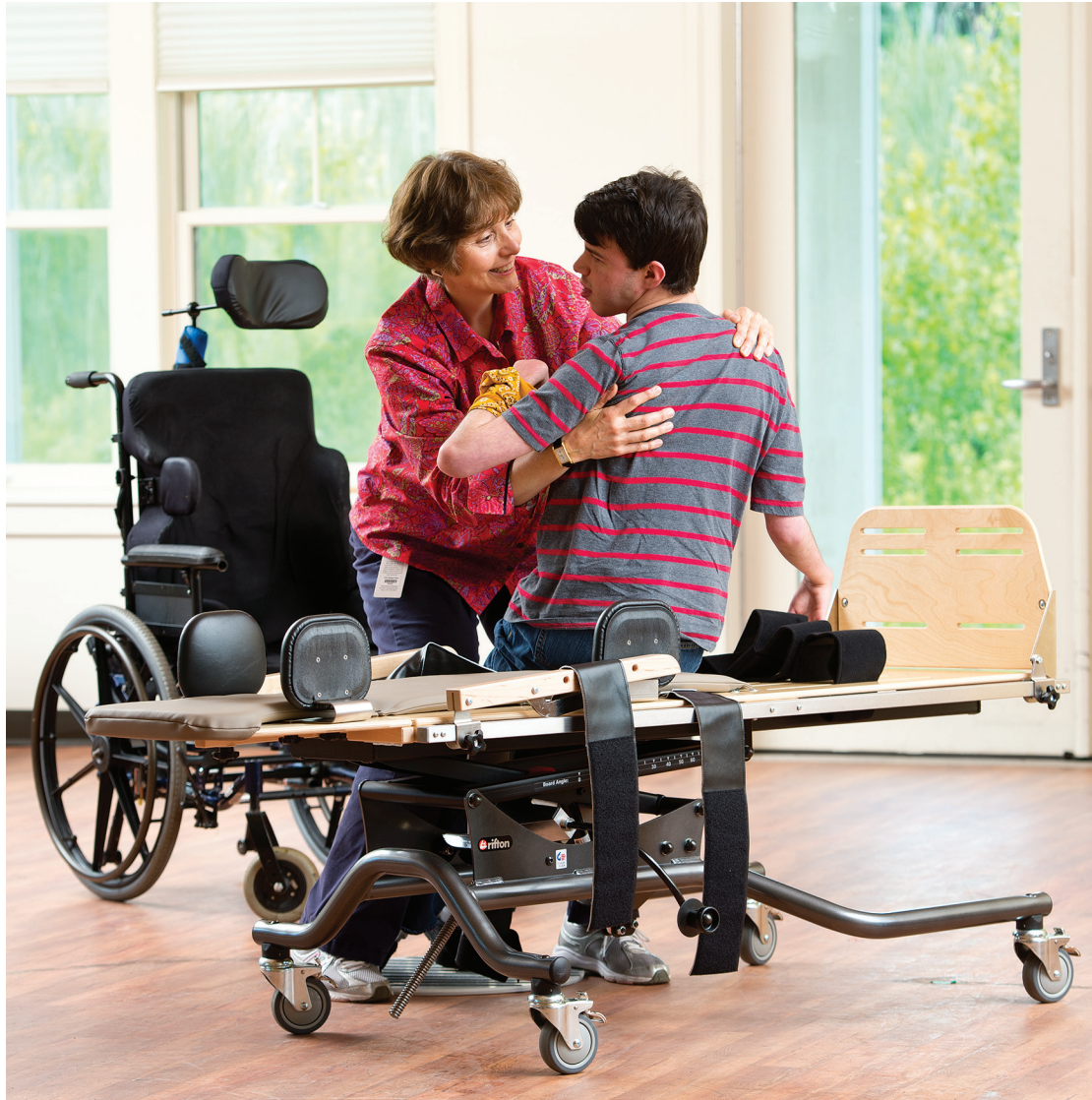
The large Supine Stander makes transfers easy. The manual crank raises the stander from 21" (wheelchair height) to 30" in the horizontal position.