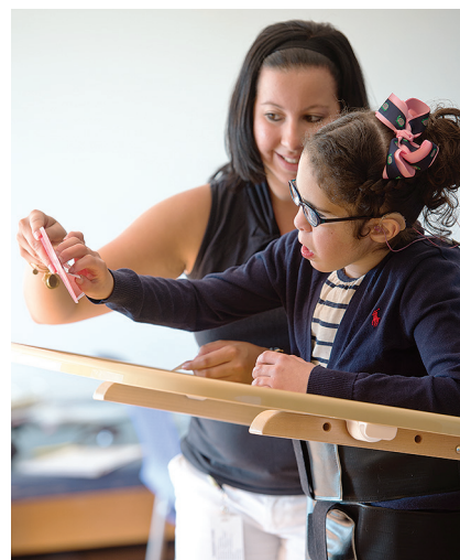
Once upright, the client is on the same level with caregivers and peers and can interact with her environment.