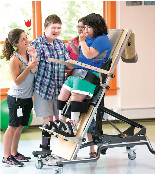
This client has advanced so far that the headrest can now be flipped back out of the way.