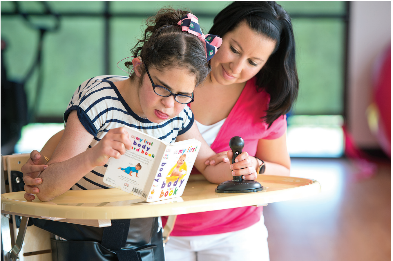
Supported by the hand Anchor, this child is able to participate in activities she enjoys.