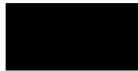
BLACK (SEAT ONLY)