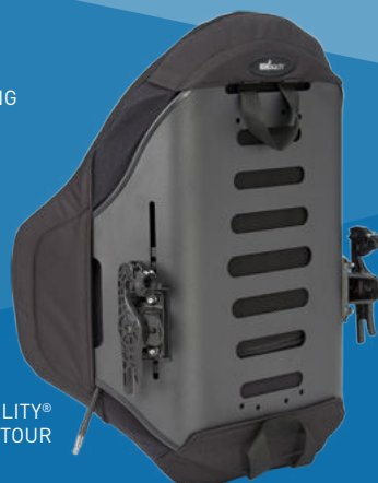
ROHO® AGILITY® MAX CONTOUR