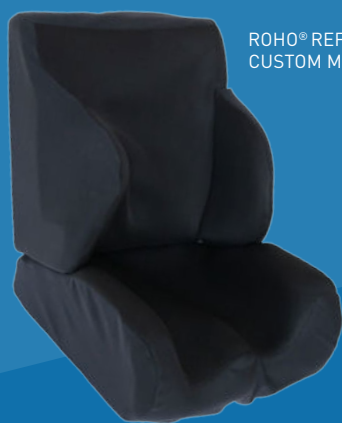
ROHO® REFLECTION® CUSTOM MOLDED SEATING