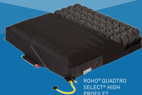
ROHO® QUADRO SELECT® HIGH PROFILE®