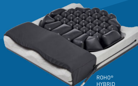
ROHO® HYBRID ELITE SR®