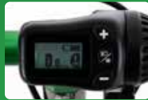
Digital LCD display