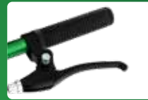
Manual hand brake