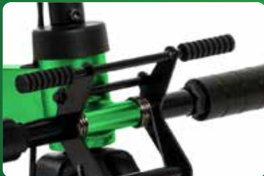
Supplemental foot brake