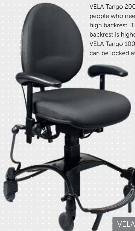
VELA Tango 200El

VELA Tango 200El is well suited for people who need comfort and a high backrest. The seat is bigger, the backrest is higher than the one on VELA Tango 100, and the backrest can be locked at a fixed angle.