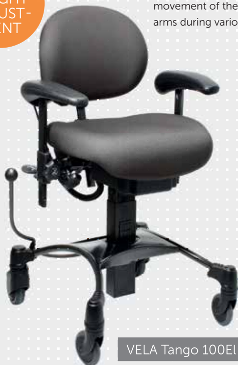
VELA Tango 100El

VELA Tango 100El's low backrest supports the lower back and allows free movement of the back, shoulders and arms during various activities.