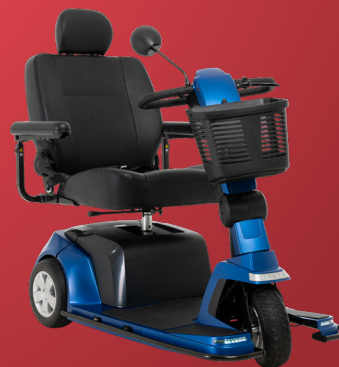
3W — FDA Class II Medical Device 1