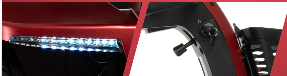
Full LED light package