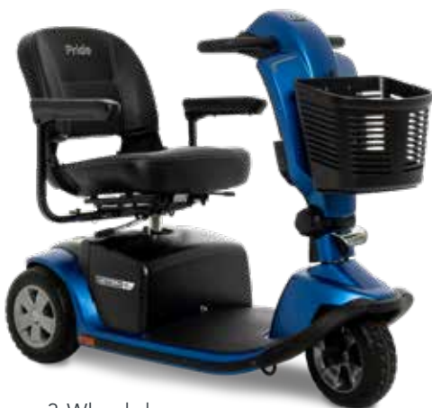
3-Wheel shown in New Ocean Blue