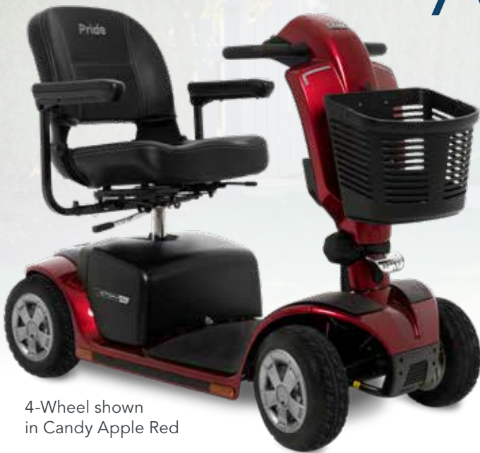
4-Wheel shown in Candy Apple Red