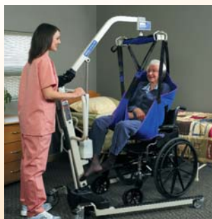
Invacare® Reliant Divided-Leg Slings with Headrest