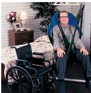
Invacare® Reliant Full-Body Slings with Commode Opening